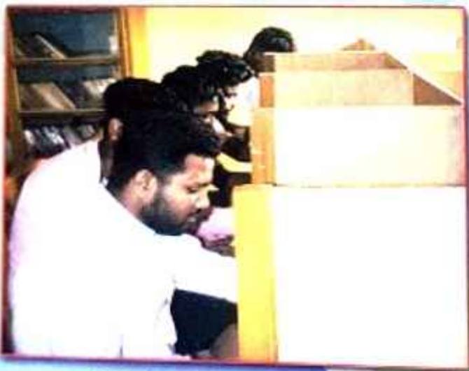
Students at Library