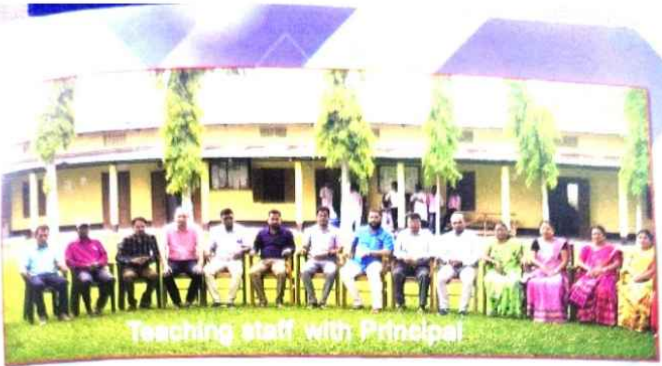
Teaching staff with Principal