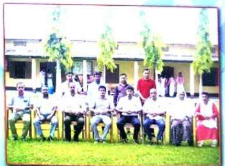
Non-teaching Staff with Principal