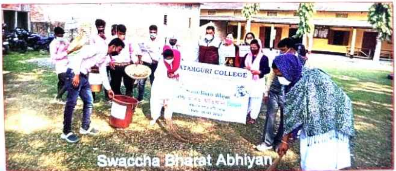
Swaccha Bharat Abhiyan