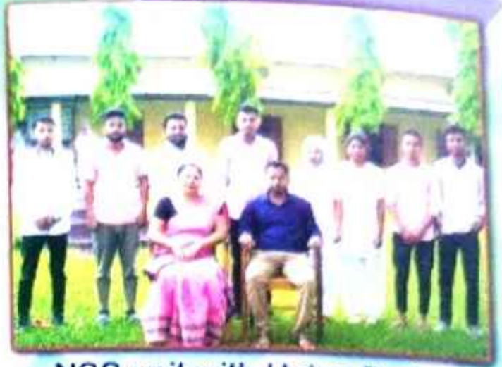
NSS unit with Union Body