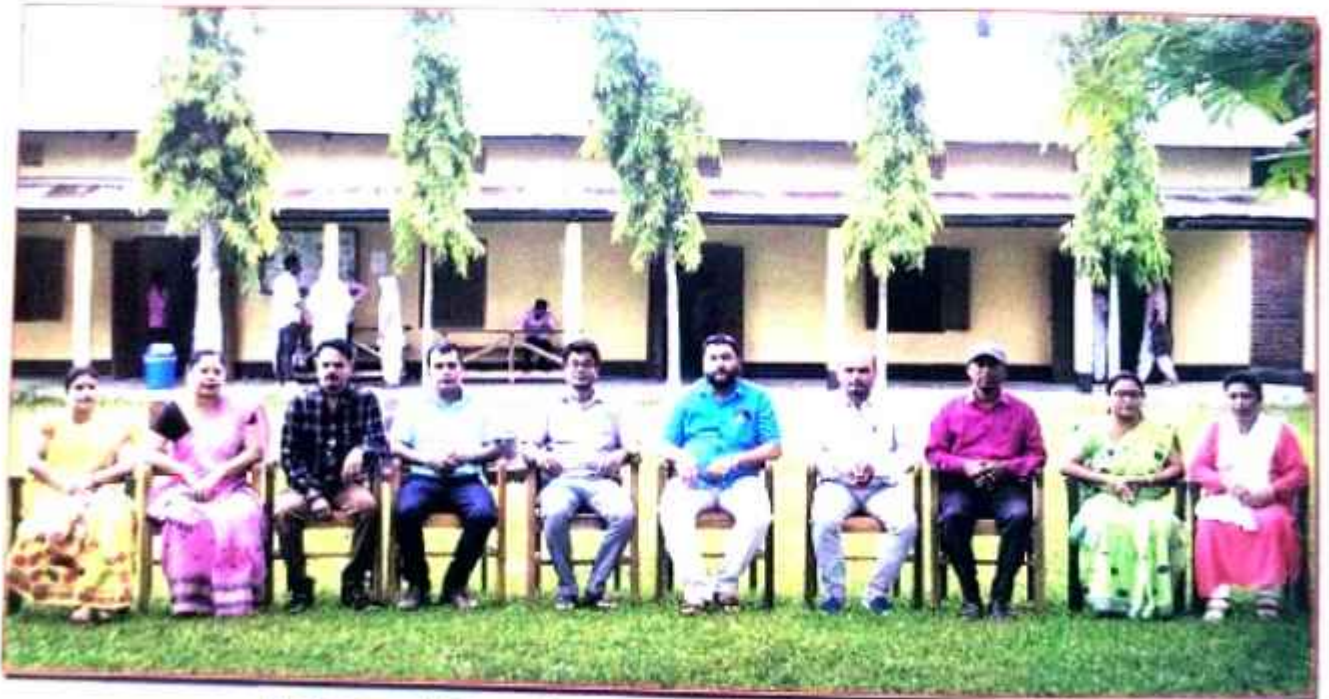
Internal Quality Assurance Cell (IQAC)