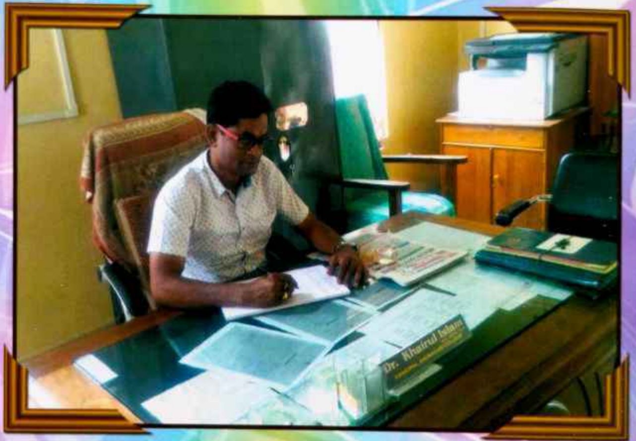
Principal, Katahguri College in working hour.