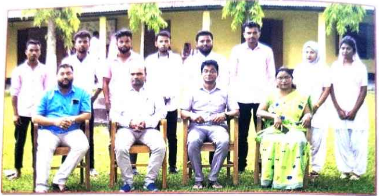
Magazine Committee with Union Body