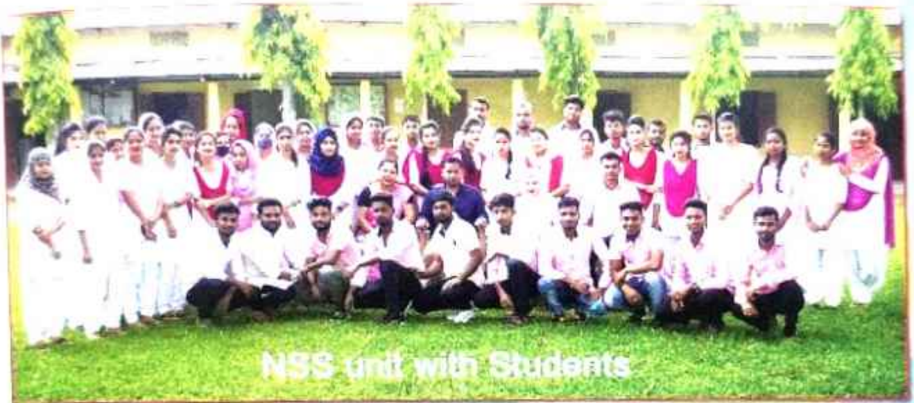
NSS unit with Students