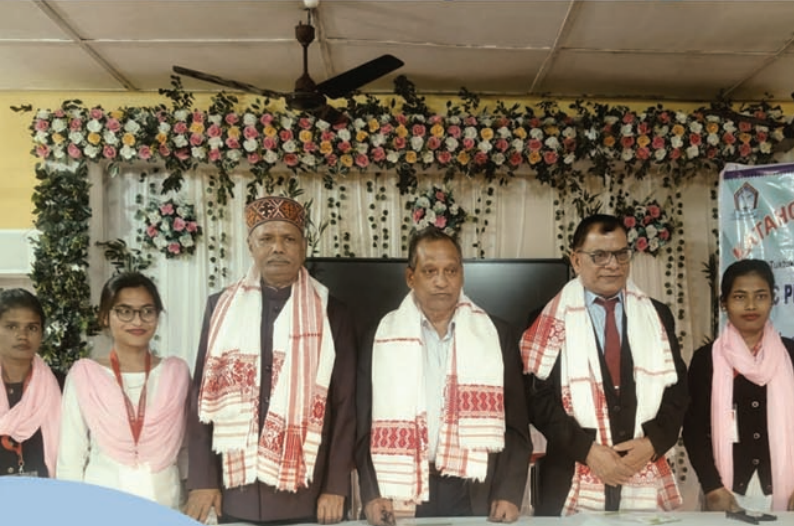
NAAC PEER TEAM