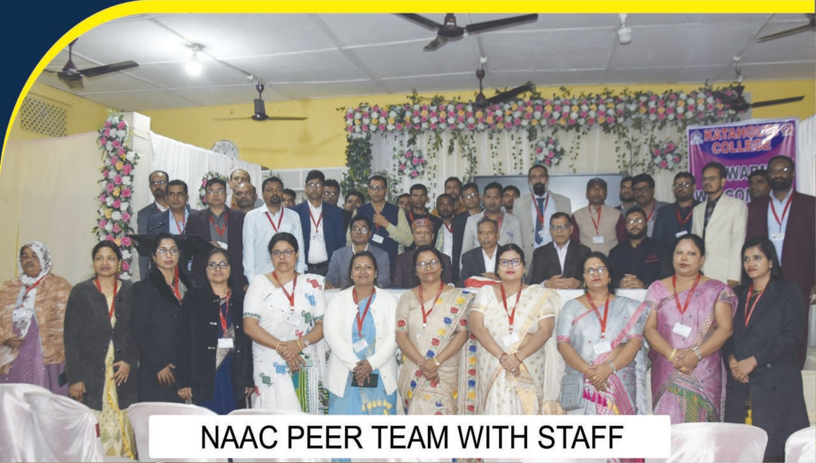
NAAC PEER TEAM WITH STAFF