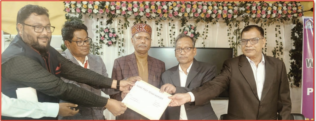
NAAC PEER TEAM WITH PRINCIPAL & IQAC CO-ORDINATOR