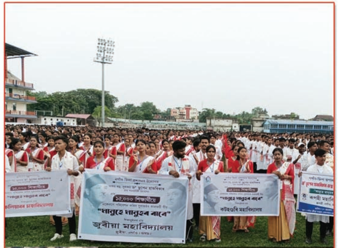
Bhupen Hazarika 100 yrs Birthday